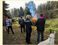
Epiphany Bonfire January 7 @ the Burnside's