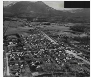
North Bend 1949