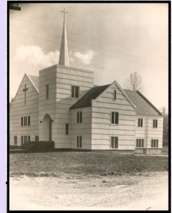
75th Anniversary - pg. 4